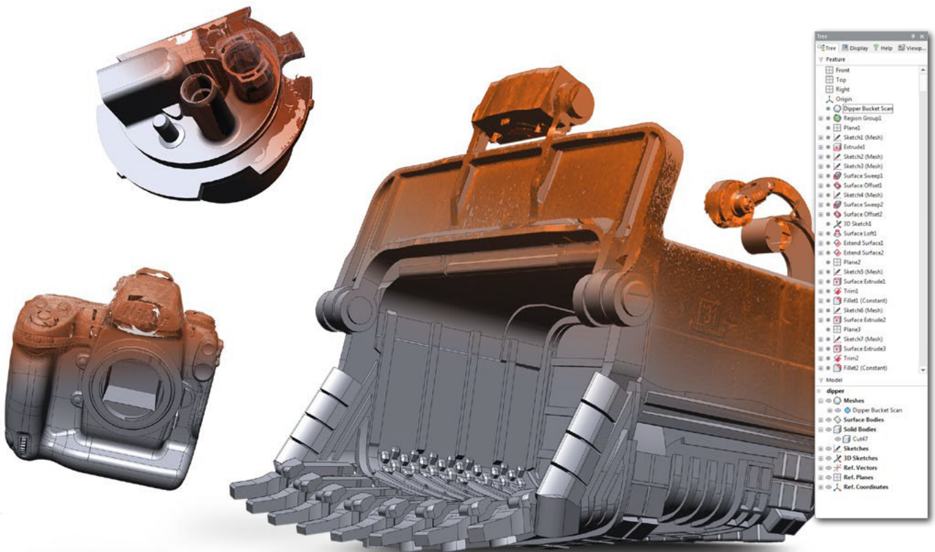
A parametric solid models created in Geomagic Design X

Save significant money and time when modeling as-built and as designed parts. Deform an existing CAD model to fit your 3D Scans. Reduce tool iteration costs by using actual part geometry to correct your CAD and elimination part springback problems. Reduce costly errors related to poor fit with other components.