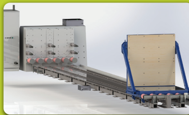
Programmable horizontal crash sled that simulates braking and cornering inputs, along with crash impacts.