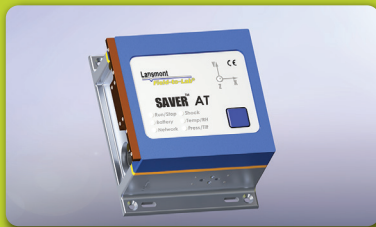
This portable Asset Tracker measures dynamic shock and vibration events.

“GoEngineer comes in with highly qualified people to make sure that all of our SOLIDWORKS products are working well. They conduct local events and provide excellent support—I think all our guys have GoEngineer's phone number close at hand; it's a great partnership,” concludes Gilman.